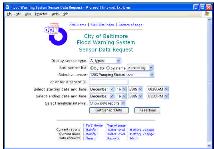
WebLynx web page 2 - Data request form