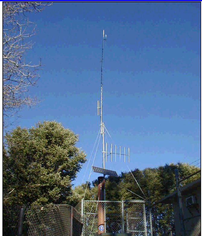
Packaged Repeater with two antennas, San Bernardino County, CA