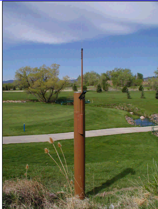
Packaged Pressure Transducer Station, City of Loveland, CO